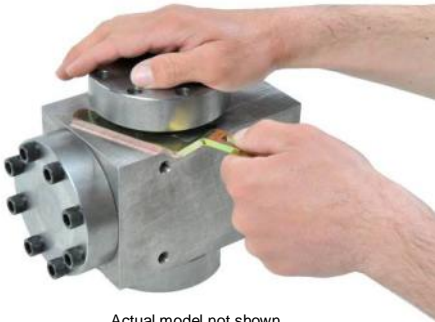
Actual model not shown